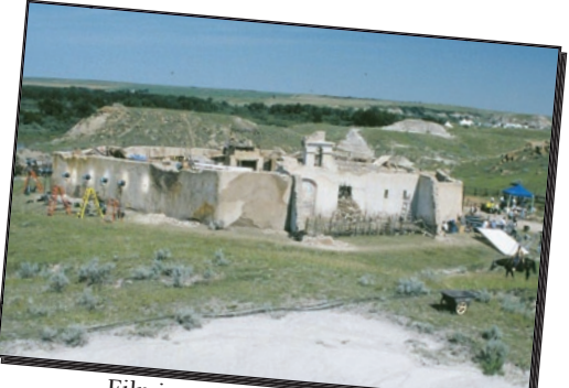
Filming of 'Texas Rangers' at Dinosaur Provincial Park

Applicants must provide either a film script or written description of the production with their application. The application must contain sufficient information to determine if the activity should be permitted. The description must explicitly describe and document any use of wild or domestic animals, non-native plant species, fire or explosives, chemicals, artificial snow, fog machines, high risk activities or stunts, discharge of firearms, safety/emergency response planning, facility modification or new construction, off-highway vehicle use or similar activities.